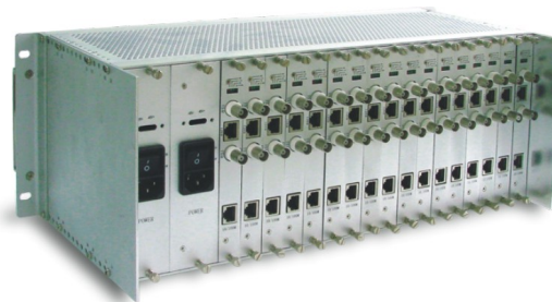
4U, 19 inch, 16 slots Rack